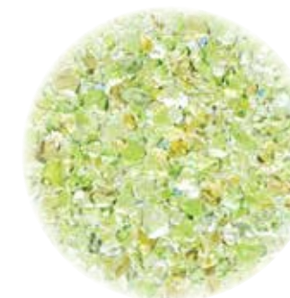
Grade 1 0.5 - 1.0mm (equivalent to Grade 16/30 sand)